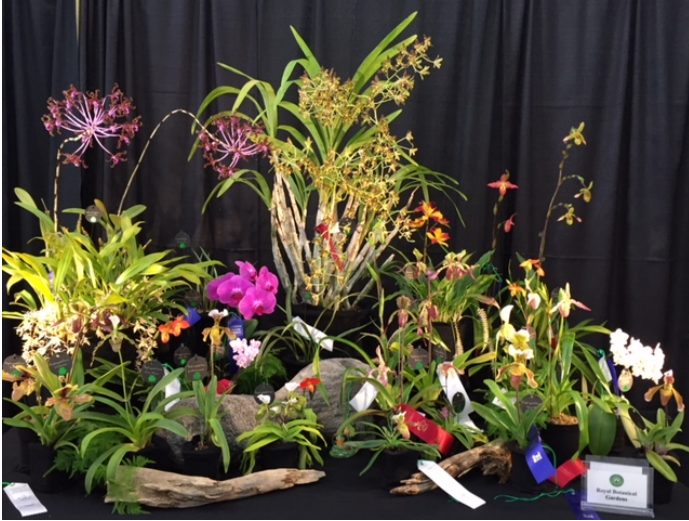
RBG Exhibit at London Show