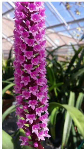
Arpophyllum giganteum RBG Greenhouse

demonstrated. If you are able to devote some time to helping us maintain the orchids, please contact