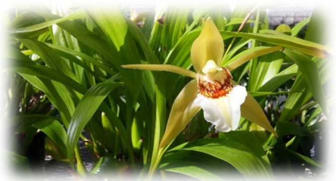
Coelogyne lawrenciana - rbg GREENJO RBG Greenhouse