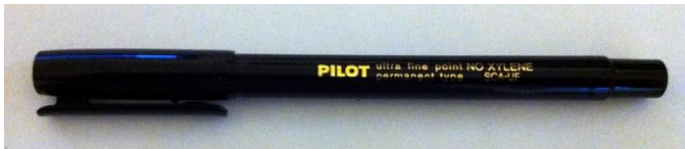
Pilot SCA-UF Pen

Sanford's Sharpie Markers are an old standard, but are prone to fading. They recently came out with an "industrial" version, and the Extra Fine Point pens are a pretty good alternative. An "Ultra Fine" version would be better, but the ink does appear to be extremely stable.